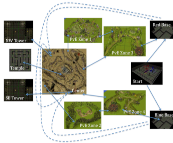
Fig. 1. Zone Configuration. Arrows denote persistent ( solid ) or contingent ( dashed ) transitions (beige) was the primary PvP zone. While the zone itself did not have any intrinsic value, it contained the access to both tower zones and the temple zone, which were crucial to the PvP game.

Each tower zone contained four switches and a vendor. A team that had all three perimeter switches simultaneously thrown to their team's colors (either red or blue) controlled the tower. The center switch caused all opponents in the zone to be paralyzed for six seconds, with a one-minute cooldown. Controlling a tower provided a bonus to the score in the temple domination minigame, provided access to more powerful items, and allowed for teleportation from the base zone to the central zone.